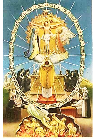
O Jesus in the Sacred Host, we offer Thee through Mary to the Father

In the past, from November 1 to November 8 a plenary indulgence, applicable only to Poor Souls in Purgatory, has been granted to those who <u>visit a cemetery and pray</u>, even if only mentally, for the departed, provided the usual conditions are met. Since the pandemic, this privilege has been extended throughout the month of November. On November 2, All Souls Day, a plenary indulgence for Poor Souls will be granted to those who