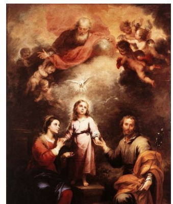
The Heavenly Trinity at work

"Dear child, I was king in the little home of Nazareth, for I sheltered within it the Prince of Peace and the Queen of Heaven. To me they looked for protection and sustenance, and I did not fail them. I received from them the deepest love and reverence, for in me they saw Him Whose place I took over them. So the head of the family must be loved, obeyed, and respected, and in return be a true father and protector to those under his care."