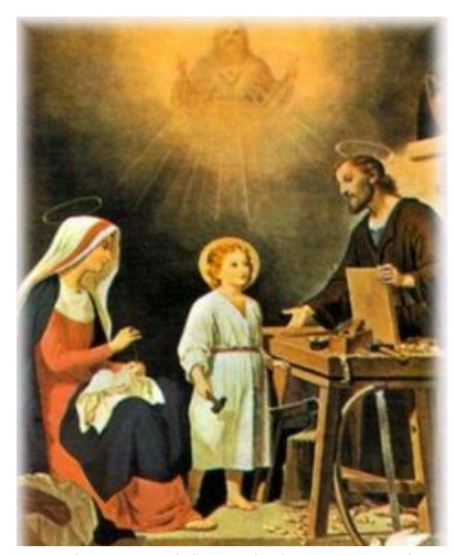
The Earthly Trinity at work

THROUGH WORK man must earn his daily bread and contribute to the continual advance of science and technology and, above all, to elevating unceasingly the cultural and moral level of the society within which he lives in community with those who belong to the same family. And work means any activity by man, whether manual or intellectual,