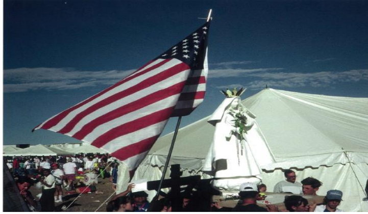
Papal Mass - World Youth Day – Denver 1993- First in America