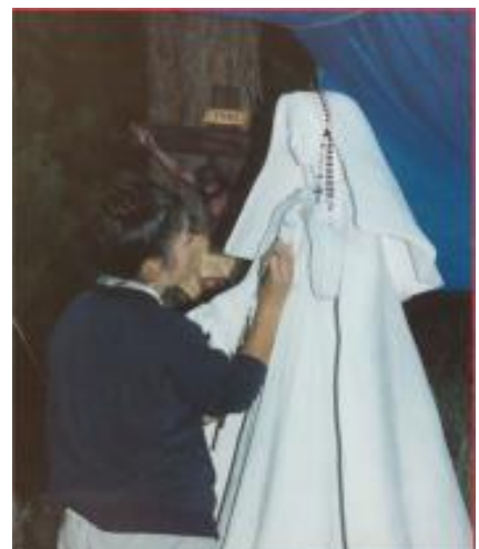
Putting the finishing touches on the statue