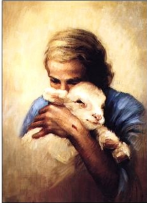
Jesus, the Lamb of God

When the Son of God became man, He established this New Covenant in the Church He founded upon the foundation of the 12 apostles. He gave us the one perfect