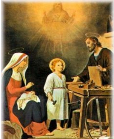
The Earthly Trinity at work

THROUGH WORK man must earn his daily bread and contribute to the continual advance of science and technology and, above all, to elevating unceasingly the cultural and moral level of the society within which he lives in community with those who belong to the same family. And work means any activity by man, whether manual or intellectual,