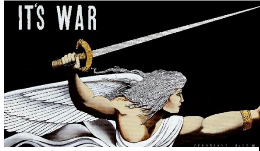
Ephesians 6:12