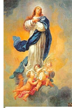
Murillo's Immaculate Conception in the Patronal Church

Conception in Jacksonville, Florida, was dedicated to the Immaculate Conception in 1584. John Carroll, the first bishop in the United States, placed his diocese of Baltimore, which encompassed the thirteen colonies, under the patronage of Mary with his pastoral letter of May 28, 1792. In 1846 the Sixth Provincial Council of Baltimore named Mary, under the title of her Immaculate Conception, Patroness of America. While Blessed Pope Pius IX approved that decision in 1847, he did not promulgate the dogma of the Immaculate Conception until December 8, 1854 with his encyclical INEFFABILIS DEUS .