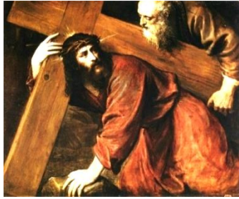
Titian – 1487 - 1576