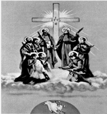
JESUIT MARTYRS OF NORTH AMERICA 1642 - 1649

Ready to Fight to the Death to Preserve the Purity of Your Souls!